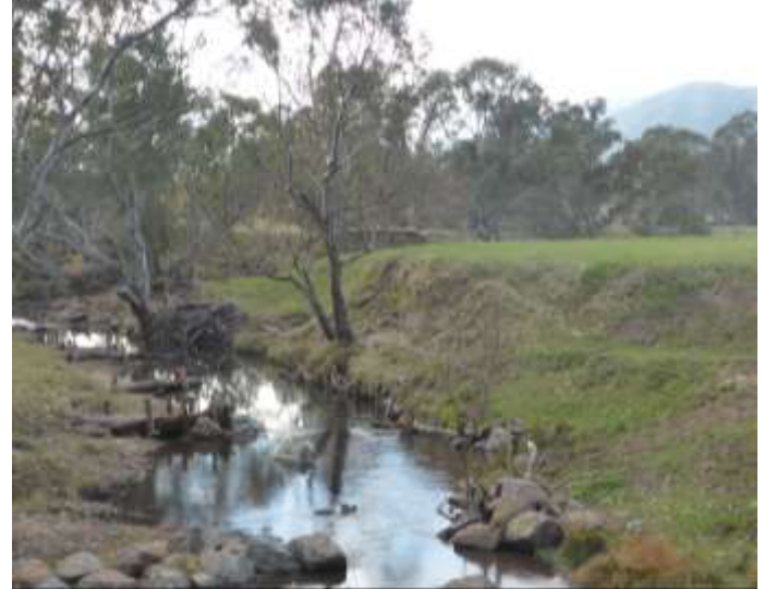
Figure 3. Instream Habitat downstream of Galls Gap Road

Immediately below Galls Gap Road instream habitat improvements works were completed in autumn 2018. This site has also recently been fenced to exclude stock and revegetated. One Macquarie perch was captured using the new structures. Many of the instream structures were out of the main channel due to the extremely low flows at the time of the survey.