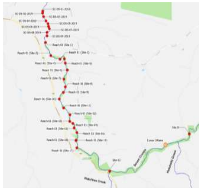
Figure 1. Map of fish survey sites on the Seven Creeks, February/March 2019

All fish species captured were measured and weighed. All fish were released at site of capture (except for carp and redfin). A small fin clip was obtained from 30 Macquarie perch and Trout cod of various sizes for future genetic analysis.